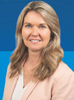
JILL DUNLOP MPP – Simcoe North/Nord

705-326-3246 • Jill.Dunlopco@pc.ola.org JillDunlopMPP.ca