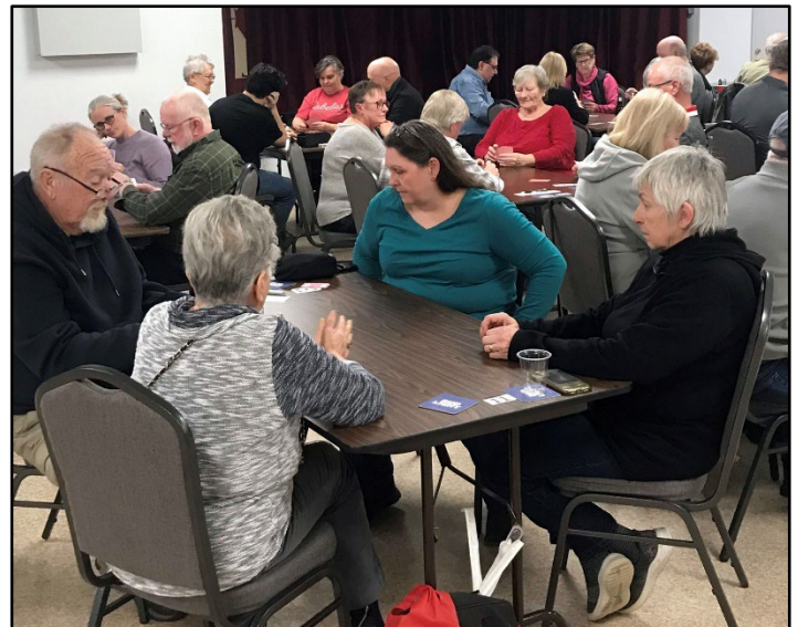
The branch was well represented at the Zone Euchre tournament held at the Coldwater Branch on February 10.

MIXED DARTS tournament will be held on March 23 in Collingwood. The closing date will be March 15. Keep in mind that you must be a member to enter in these events. Anyone interested, please do not hesitate to reach out.