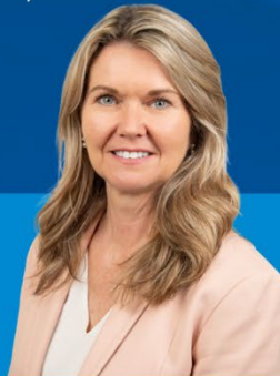
JILL DUNLOP MPP – Simcoe North/Nord

705-326-3246 • Jill.Dunlopco@pc.ola.org JillDunlopMPP.ca